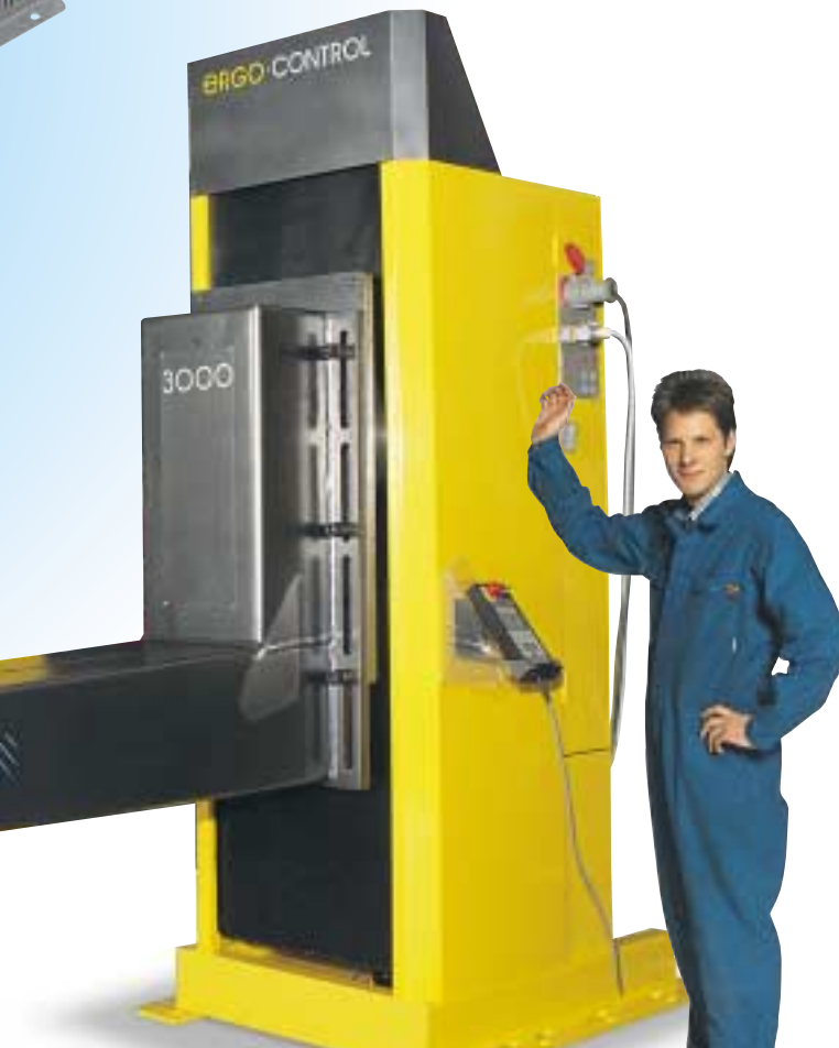
Capacity 3000 kg