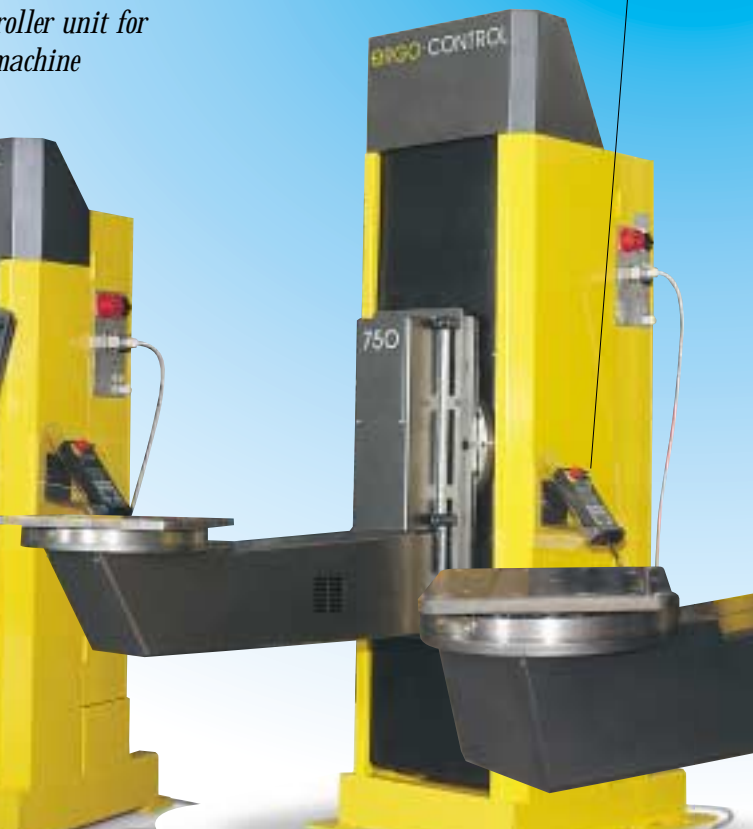
Capacity 750 kg