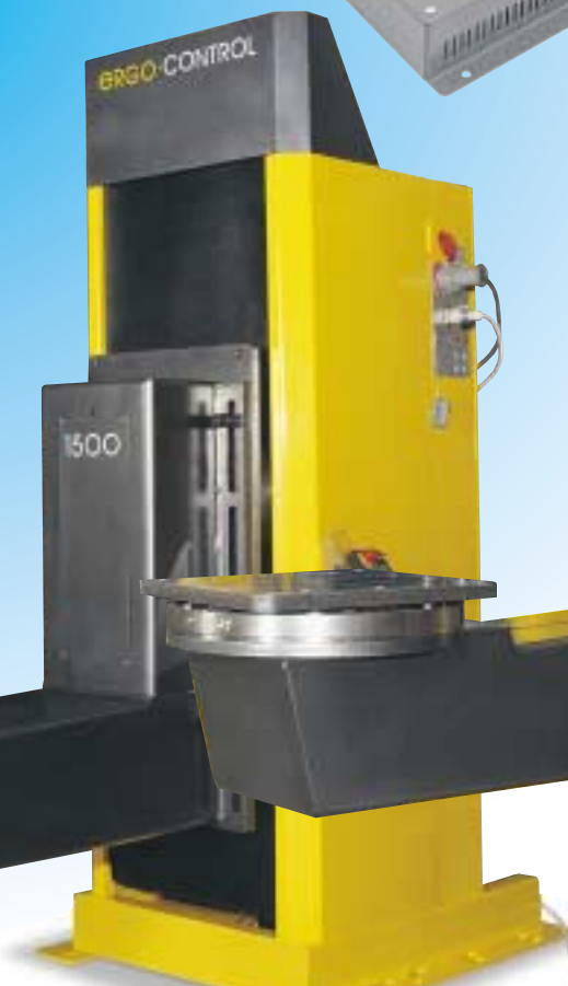
Capacity 1500 kg