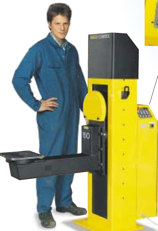
Capacity 150 kg