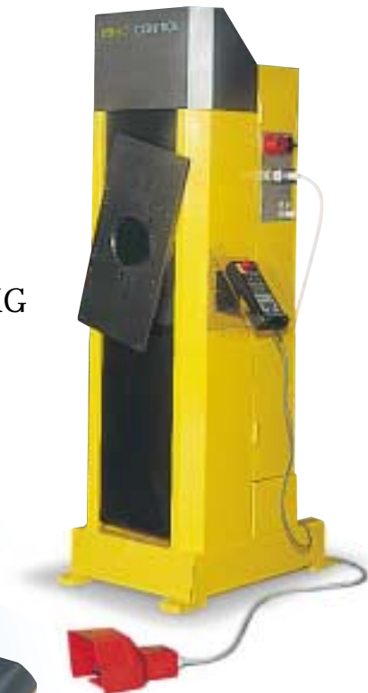
The positioners can also be supplied in 2 Axis' form