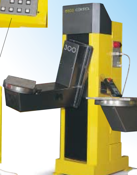
Capacity 300 kg