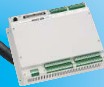
Program controller with a capacity of 1000 step.