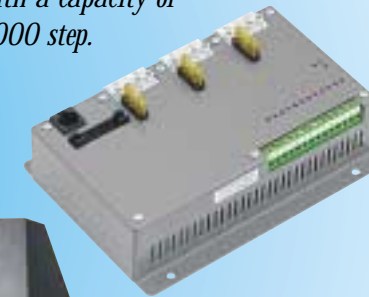
Controller unit for manual operation